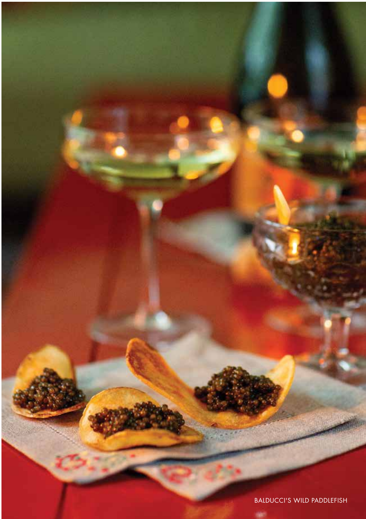
BALDUCCI'S WILD PADDLEFISH