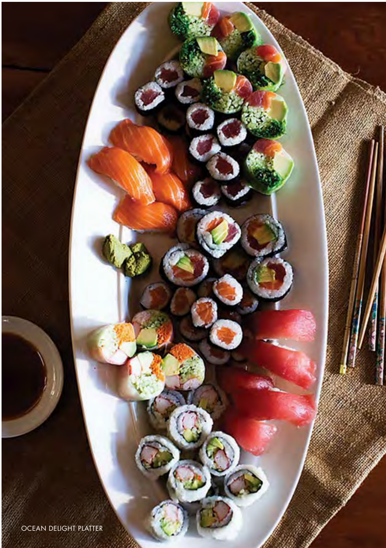
OCEAN DELIGHT PLATTER