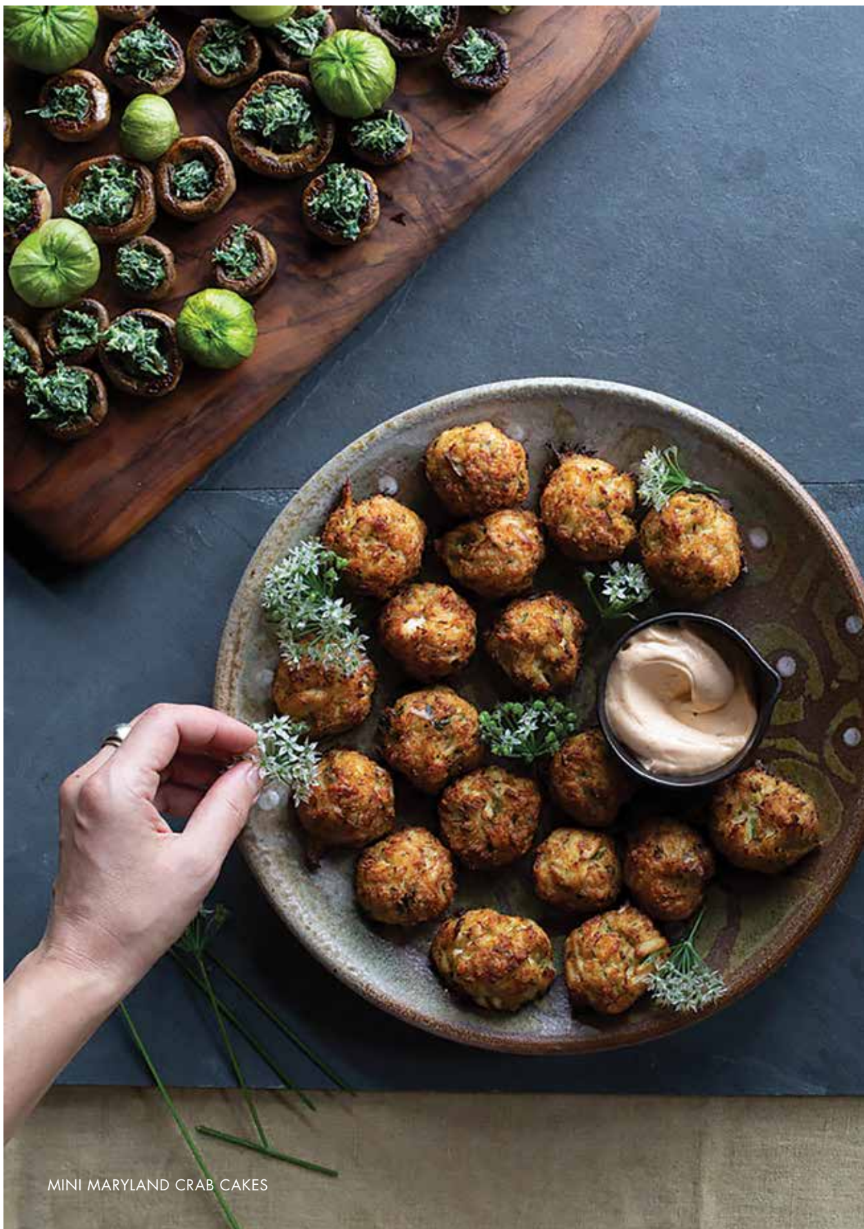
MINI MARYLAND CRAB CAKES