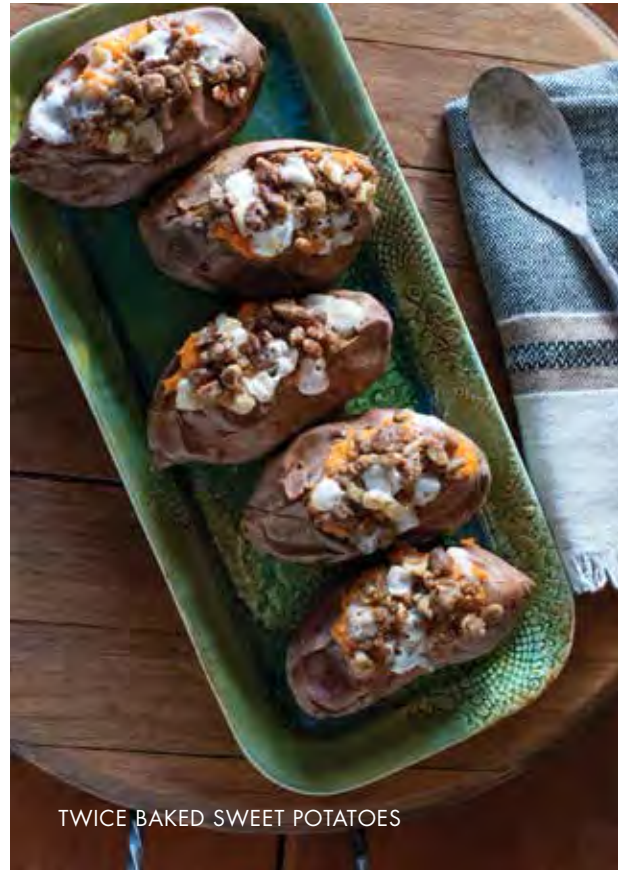
TWICE BAKED SWEET POTATOES