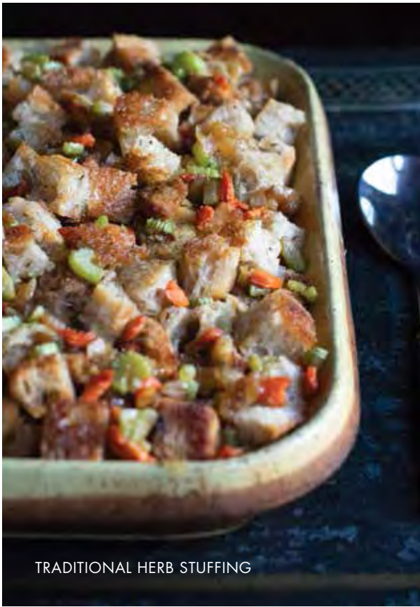
TRADITIONAL HERB STUFFING