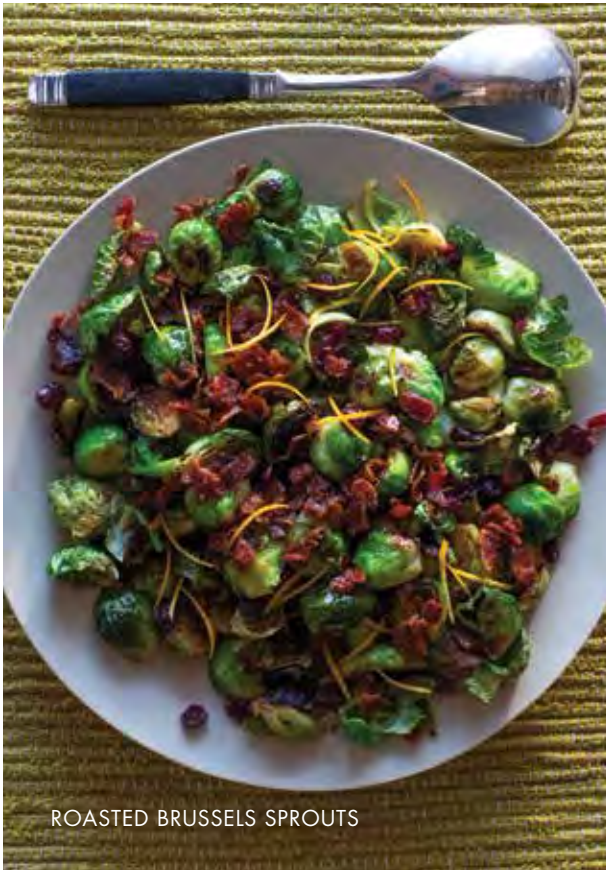
ROASTED BRUSSELS SPROUTS